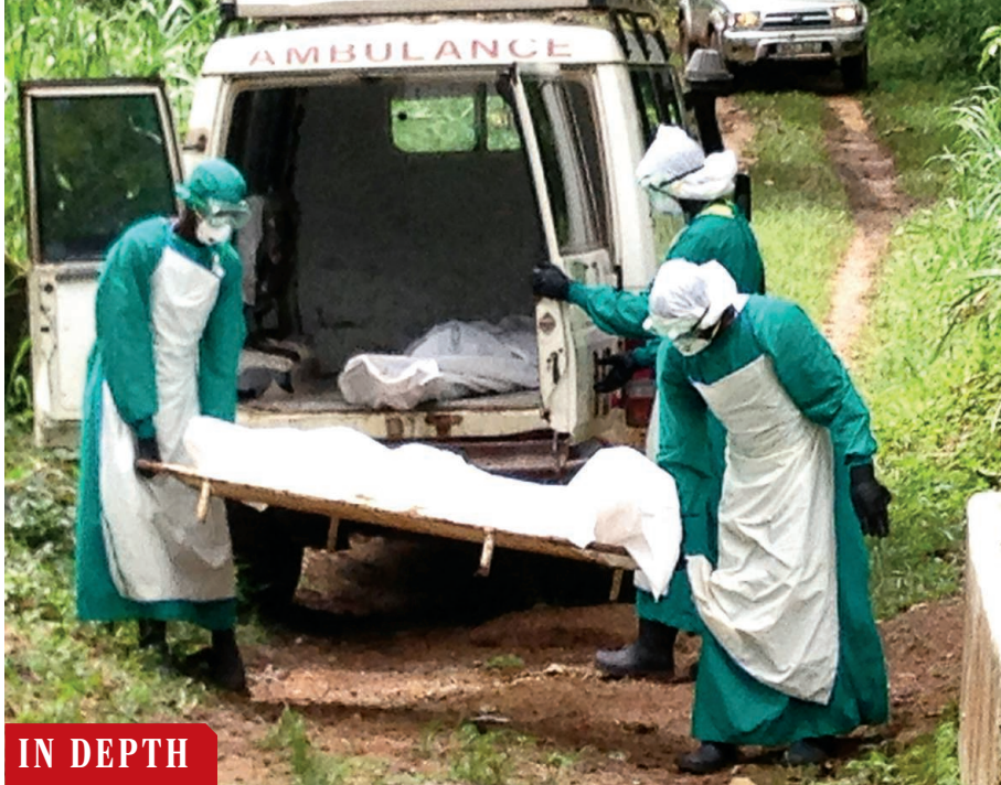
Health workers carry the body of an Ebola virus victim in Kenema, Sierra Leone, on 25 June 2014.